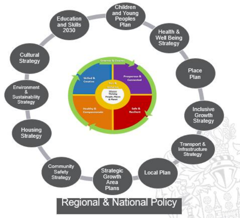
Figure 1: Strategic Alignment of Key Strategies